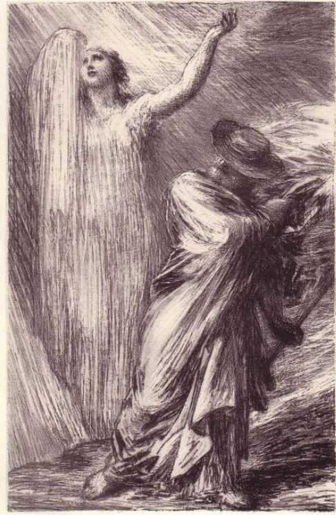
Wotan calls Erda Henri Fantin-Latour 1885